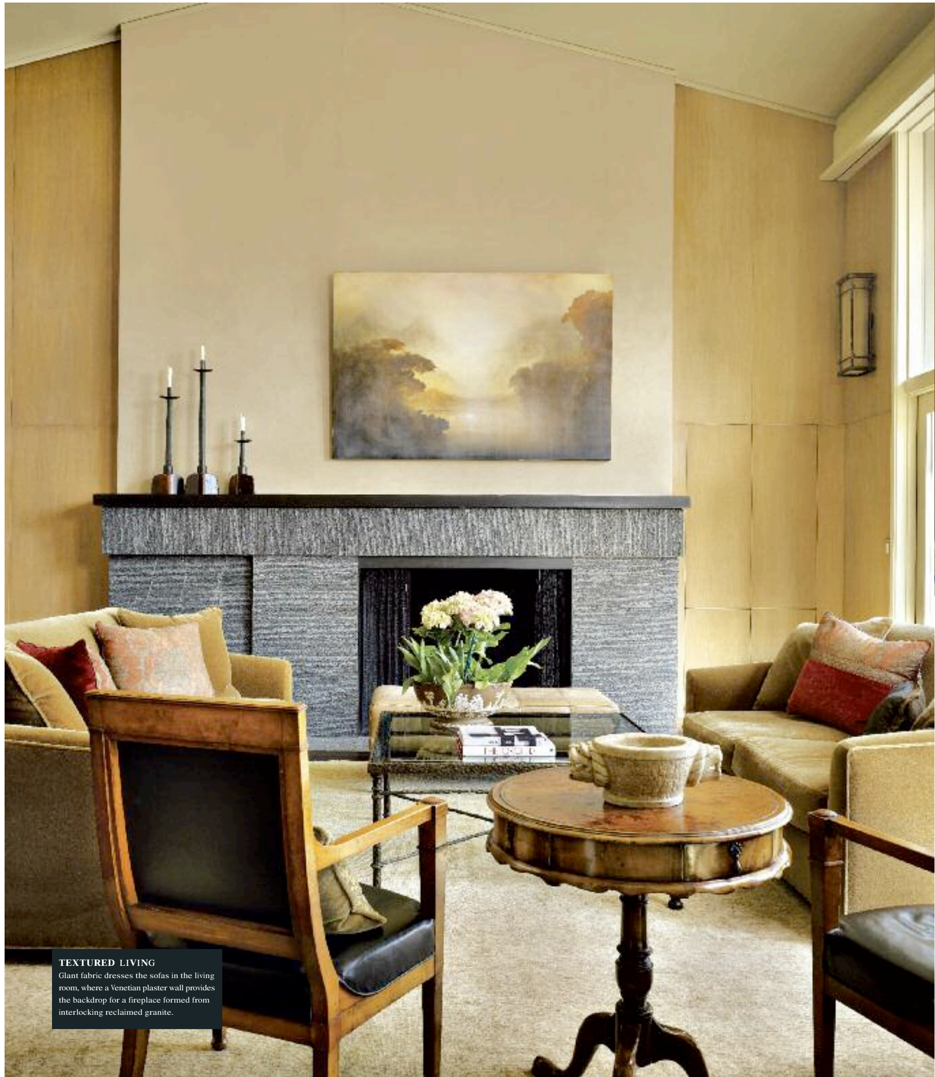
TEXTURED LIVING Glant fabric dresses the sofas in the living room, where a Venetian plaster wall provides the backdrop for a fireplace formed from interlocking reclaimed granite.