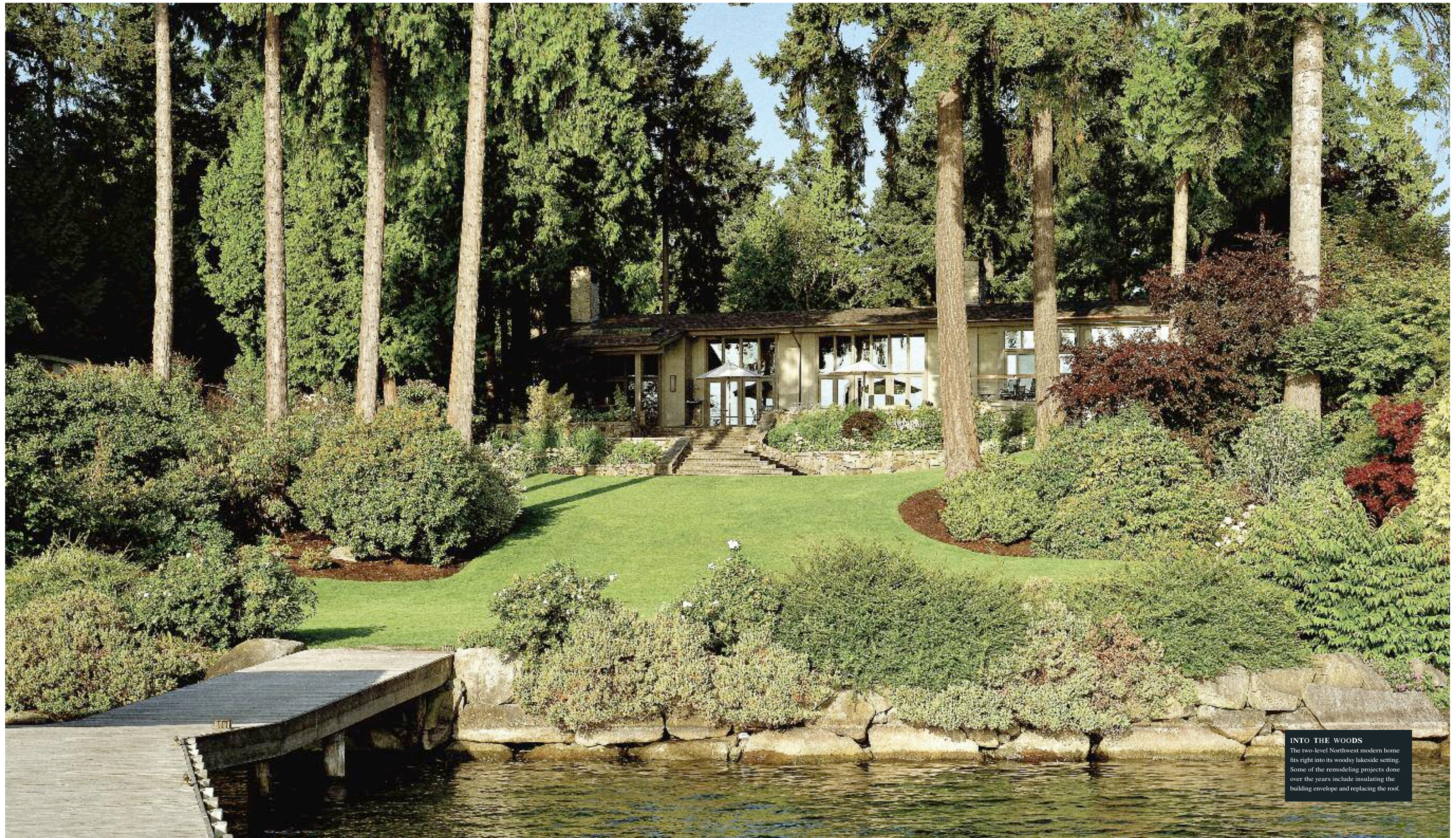
INTO THE WOODS The two-level Northwest modern home fits right into its woody lakeside setting. Some of the remodeling projects done over the years include insulating the building envelope and replacing the roof.