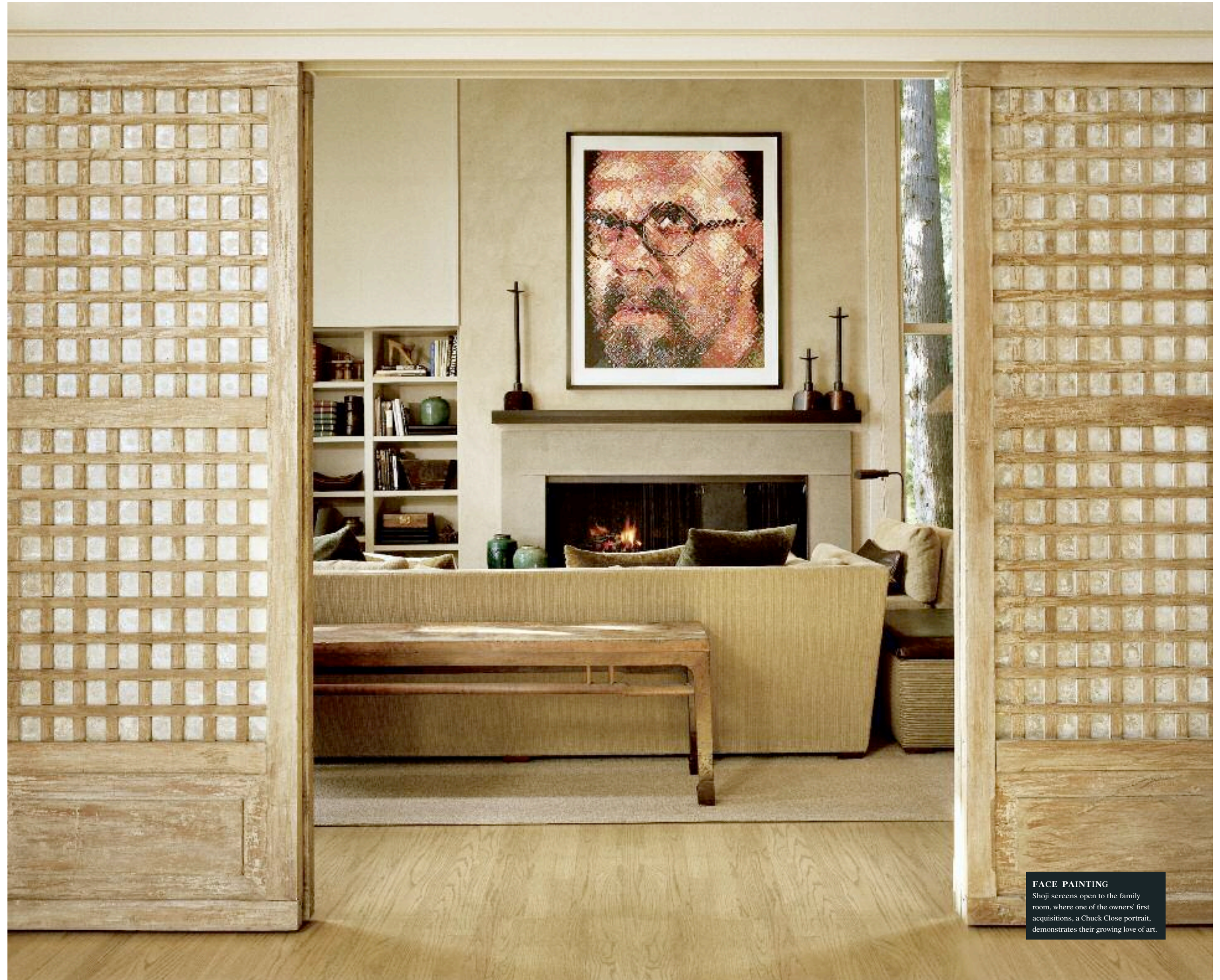
FACE PAINTING Shoji screens open to the family room, where one of the owners' first acquisitions, a Chuck Close portrait, demonstrates their growing love of art.